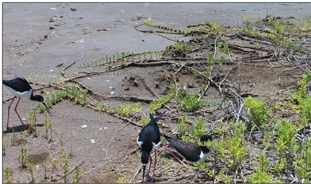
FIGURE 2 Two male Hawaiian Stilts foraging near a nest site, while one female incubates a nest with three eggs in the Waiawa wetland unit of the Pearl Harbor National Wildlife Refuge on O'ahu on 25 May 2019. Photograph taken from a nest camera

On 25 April 2020, a nest with five eggs was found within MCBH-KB on O'ahu (Figure 3a). A Bushnell trophy camera was used